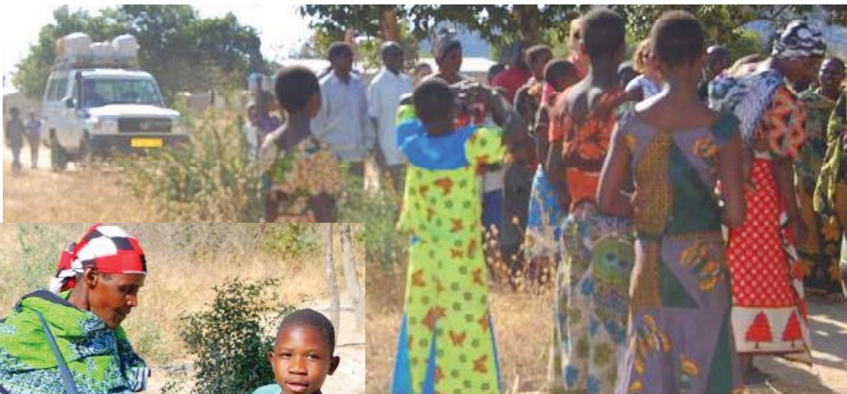
(Left) On Distribution Day the villagers await the arrival of the Land Rover with visitors and supplies. (Below) They listen to the speakers, who talked of the linkage being formed between the people in Chigongwe and those in our Georgia churches.