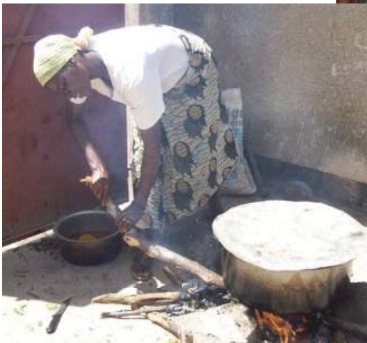
(Above) A woman prepares food for the special day. Breaking bread together is an act of hospitality in Africa. (Right) The children are dressed in their new uniforms (note the zebra socks on some of the boys).