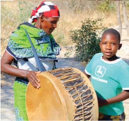
(Above) Music is an important part of the festivities—especially drums.